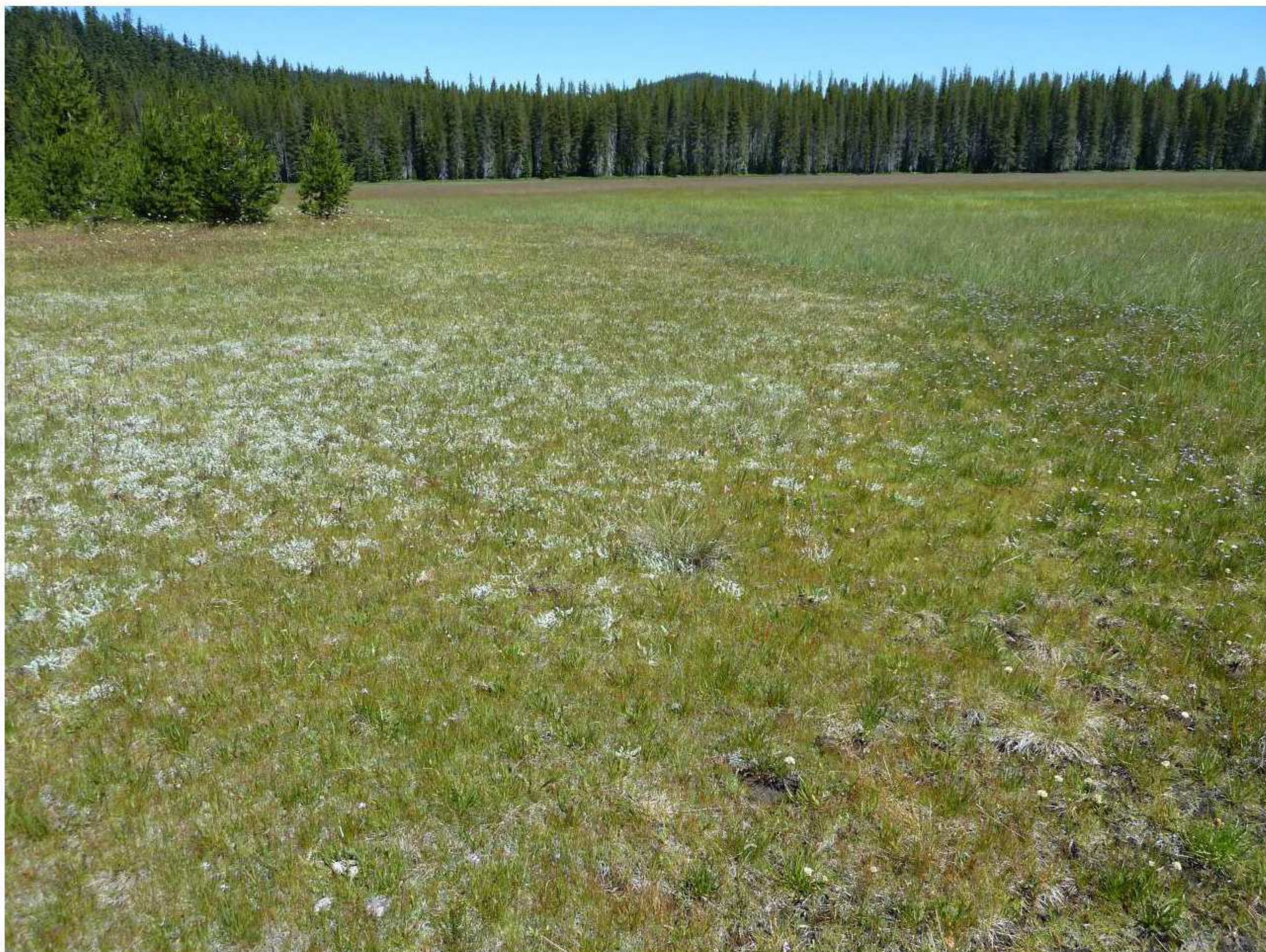
Figure 7. Habitat of Castilleja collegiorum , Big Meadows, 15 Jul 2013. Plants occur mostly in left side of the photo, between the trees on the left and the lower, wetter ground on the right.